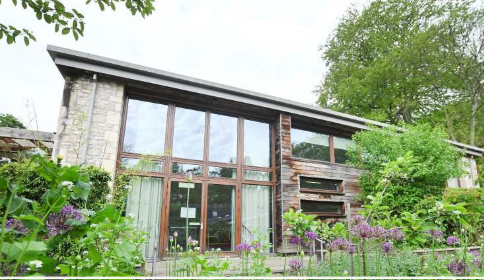
Batheaston Church School, May 2026